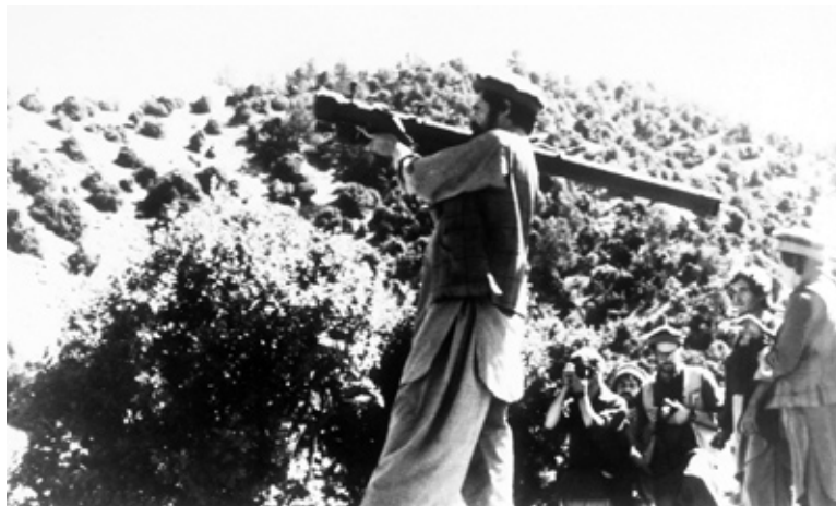
An Afghan mujahideen demonstrates positioning of a hand-held surface-to-air missile, August 1988.

Samuel Huntington asserts that 75 percent of the funds provided by the U.S. to train Islamic recruits went to "the more fundamentalist Islamist groups, with 50 percent of the total going to the most extreme Sunni fundamentalist factions." 20 Much of the U.S.-supported training took place in madrasahs. Thus, the foreign aid provided to the U.S.'s Cold War Muslim allies had two unforeseen results: it helped indoctrinate, train, and equip battle-hardened legions of mujahideen mainly from the most anti-Western, anti-modernist sects in Islam; and it facilitated and further institutionalized an educational system that inculcated extreme and violent