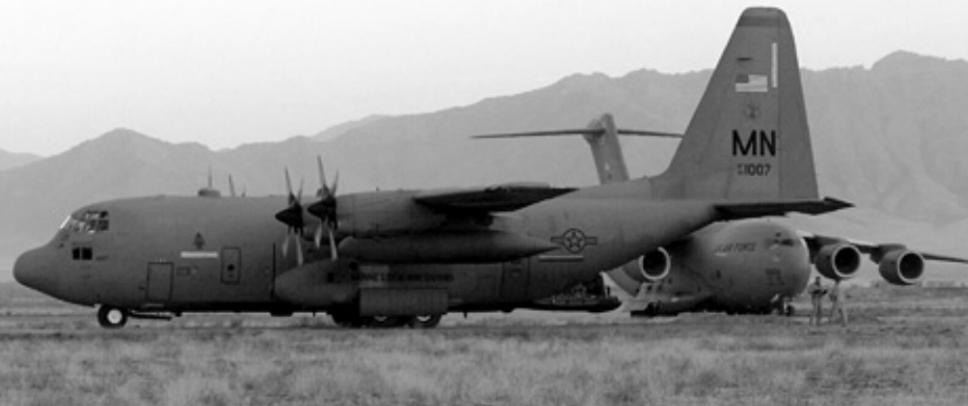
A Minnesota Air National Guard C-130 Hercules aircraft waits to be unloaded on the airfield at Bagram, Afghanistan in support of Operation Anaconda, 11 March 2002. A U.S. Air Force C-17A Globemaster III is parked in the background.

enemy encampments in the valley. This main attack will force the enemy to stay, fight, and die, or attempt escape into the deadly fire of the BP forces and CAS.