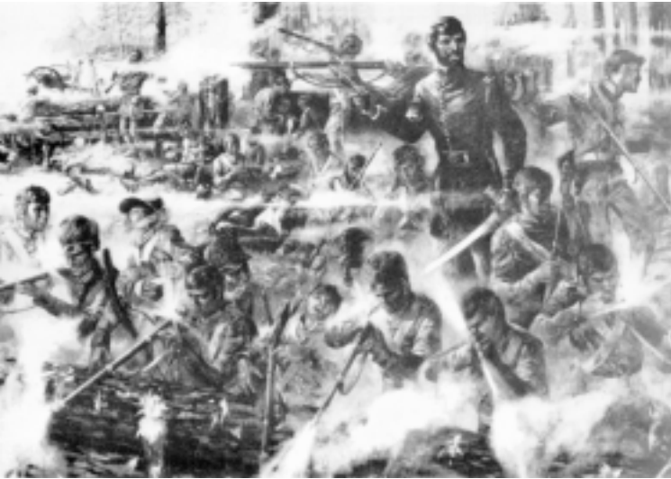
Museum of Florida History, Tallahassee, Florida

During the Second Seminole War, Major Francis L. Dade and all but three soldiers of his 110-man detachment were killed on 28 December 1835 during an ambush near Ocala, Florida.