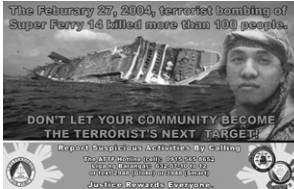
Figure 3. AFP/U.S. public information product

The JSOTF has increasingly emphasized information operations that heighten public awareness of the negative effects of terrorism and provide ways to report terrorists to local security forces. Also featured are positive actions the government and military take to foster peace and development. The introduction of a Military Information Support Team in 2005 significantly enhanced the production of print and media products in support of U.S. and Philippine Government WOT information objectives. 59 Products include newspaper ads, handbills, posters, leaflets, radio broadcasts, and novelty items (example at figure 3). These IO efforts have helped to raise public awareness of the U.S. Government's rewards program. 60 Osama bin Laden's chief lieutenant, Ayman al-Zawahiri, has said, "More than half of this battle is taking place in the battlefield of the media. We are in a media battle in a race for the hearts and minds of Muslims." 61 If this is true, then shaping an environment less conducive to terrorist activity by raising public awareness is a true combat multiplier.