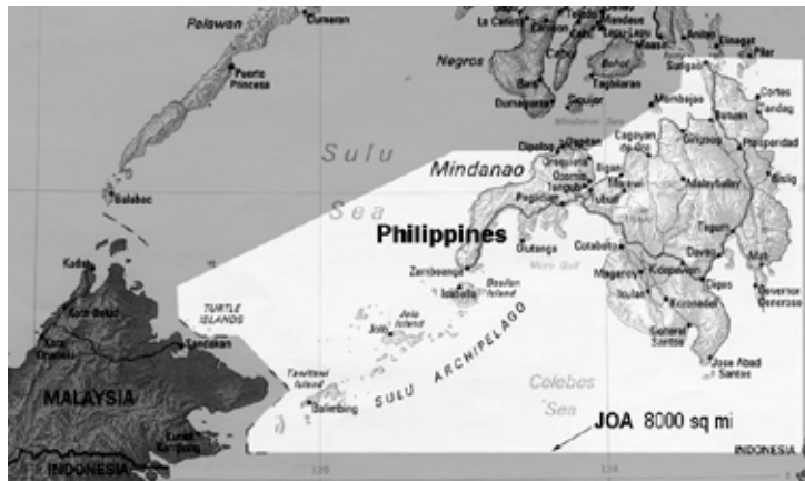
Southern Philippines— Joint Operations Area

age of frustratingly narrow rules of engagement. That is because fledgling democratic governments, besieged by young and aggressive local media, will find it politically difficult—if not impossible—to allow American troops on their soil to engage in direct action.