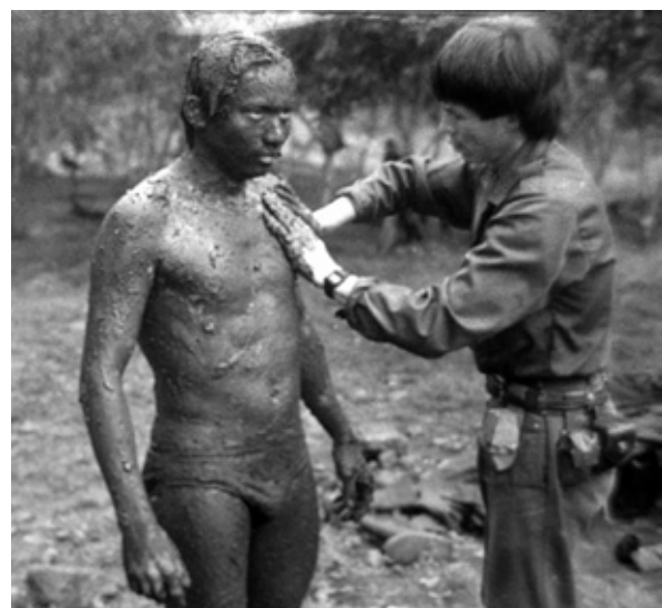
In this captured photo, a FARC sapper applies natural camouflage. FARC sappers have in the past been trained by Vietnamese, Cuban, and FMLN operators. They specialize in infiltration attacks.

FARC's vulnerabilities had been recognized by the new military leadership that emerged following Pastrana's inauguration. They had crafted their