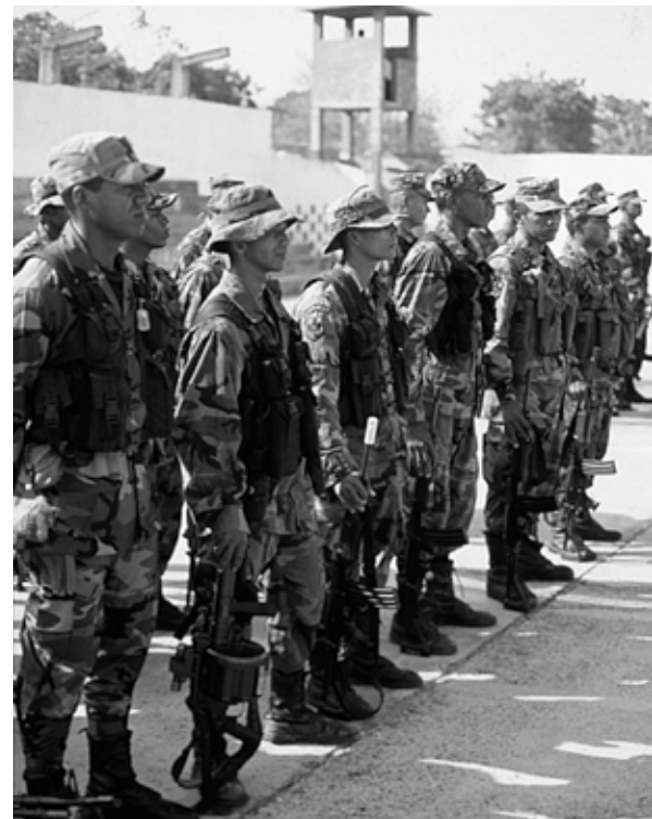
A local-forces platoon, part of the Home Guard that has been key to Colombia’s successful COIN approach, prepares for an inspection prior to a mission.

But in the absence of local forces, which had fallen afoul of constitutional court restrictions and thus were disbanded, it was difficult to consolidate gains. As areas were retaken, they could not be