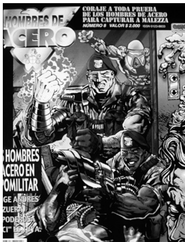
Democratic Security covers all bases: comic books, cartoon shows, a website, school appearances, and other psyop products have been deployed to win over Colombia's newest generation.

Eliminating the "strategic rear guard" is crucial. There is a common misconception that "guerrillas" are self-sustaining, obtaining all they need either by