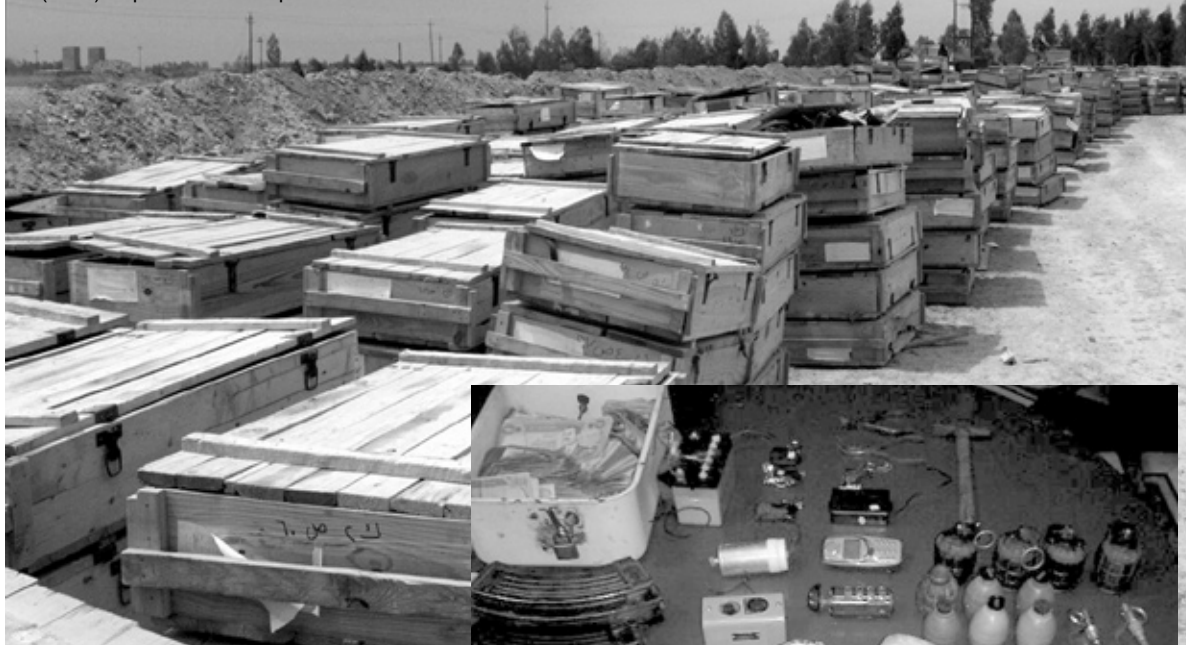
An ammunition dump at Tikrit Airport, 19 April 2003. (Inset) Captured IED components.