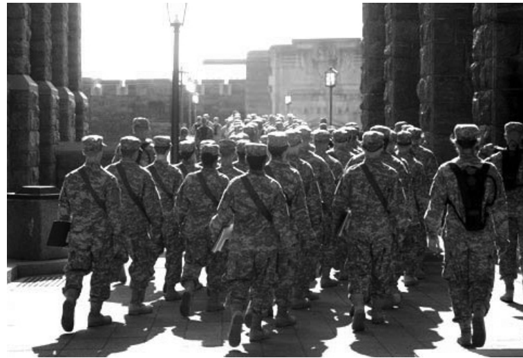
The next generation: members of the West Point class of 2011 cross the bridge to Thayer Hall, where they will receive basic training classes.

Within the military, perhaps the most important thing we can do to help secure the future of our institutions is to ensure that those junior leaders and service