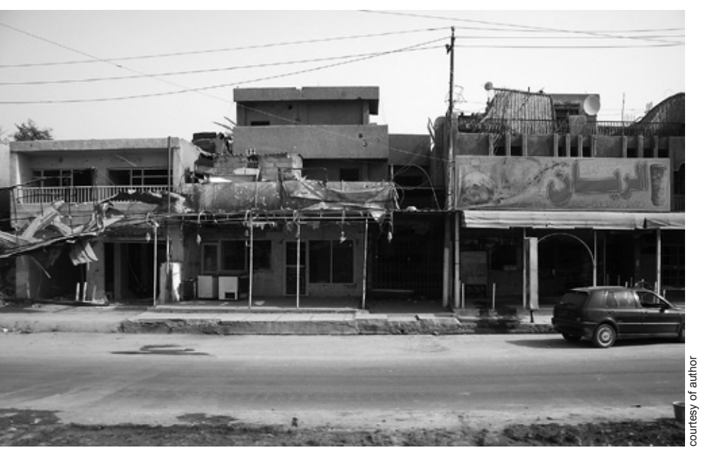
Damaged buildings from fighting in Ameriyah in May/June 2007.

We faced enormous challenges in Ameriyah. In truth, AQI controlled the neighborhood. While the majority of the population did not actively support them, AQI's active minority ruled the area with fear and intimidation. The barrier system we emplaced to control insurgent movement was ineffective because it had numerous holes in it that allowed virtually unencumbered routes of ingress