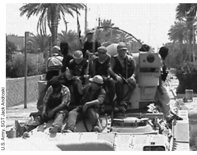
Forsan al-Rafaidan fighters on a Bradley Fighting Vehicle, June 2007.

We went through various name changes for the group, settling on the Forsan al-Rafaidan, or "Knights of the Land of Two Rivers." During our time in Baghdad, they were more generically known as "concerned local citizens," which has since changed to the "Sons of Iraq." As the people saw success, the numbers of volunteers grew. For the first month, the number hovered around 30, but when we signed a security contract with them 3 months later, we had almost 300. These men fought, and in some cases died, without being paid for over three months. Many have argued that the only reason the Sunnis came over to our side was because we were paying them. In our area, that claim was inaccurate.