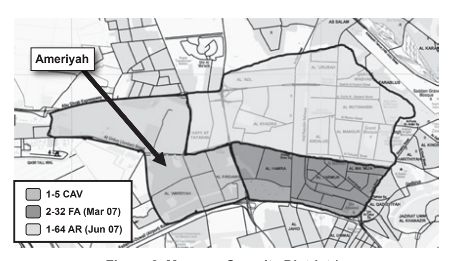
Figure 2. Mansour Security District.4

During the deployment, we faced the challenges of trying to moderate the sectarian violence permeating our operating environment. We benefitted from the increase in troops provided by the surge. Along with the other subordinate units of the Dagger Brigade, we pushed out into sector, establishing several combat outposts and joint security stations. We saw dramatic improvements in security when