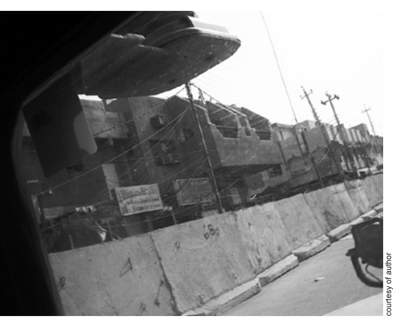
Barriers at entry control point into Ameriyah, December 2007.

The additional combat power allowed us to increase patrolling in Ameriyah. We limited the number of large-scale cordon and search operations of residential houses and instead specifically targeted areas in which AQI was said to be meeting or passing out literature and CDs. We continued to improve the barrier system around the neighborhood, this time using six-foot-tall obstructions and emplacing them away from the houses. The