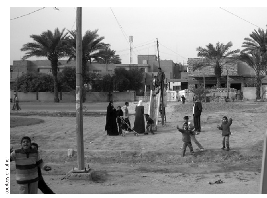
Playground in Ameriyah, December 2007. This field was called Body Drop Field due to the number of dead bodies left behind by Al-Qaeda.

The basis of our success in Ameriyah was disciplined Soldiers who acted with restraint in the face of adversity and leaders down to the squad level who understood that we needed the support of the local population to defeat Al-Qaeda. We built upon the relationships and success of the Soldiers who went before us and passed on as much as we could to the Soldiers who followed us. Developing the trust of the local people was essential. To build that trust we had to show we were committed to