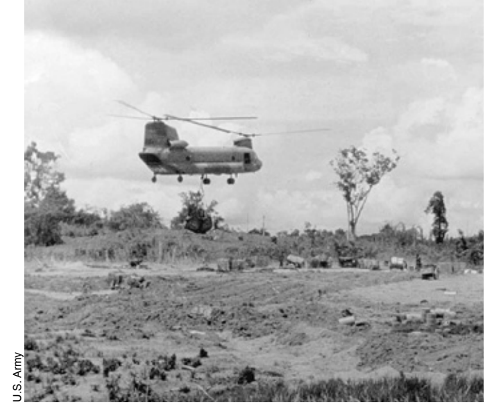
A CH-47 Chinook helicopter lifts off a slingload of ammunition from fire support base Myron in Cambodia, 24 June 1970.

Washington Post, face "mission failure." Whatever the outcomes of the President's decision and the current Afghan election in the next few weeks, however, they will not affect the extraordinary similarity of the two conflicts.