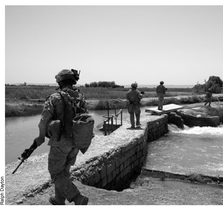
Members of a 6th Marines "weapons company" crossing an irrigation canal while on patrol in Helmand Province, May 2008.

Conceptually, what the West has attempted to do in Afghanistan since 2001, enshrined in the fatally flawed Bonn Process, is make the government side of the triangle the longest through the policy of "extending the reach of the central government." 36