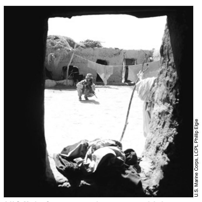
A U.S. Marine Corps sergeant clears a compound during a patrol in Nawa district, Helmand province, Afghanistan, 29 August 2009.