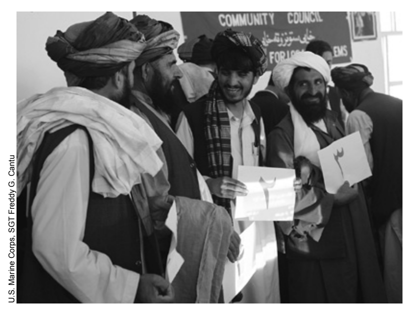
Village elders running for city council hold up numbers as locals cast votes during an election in the Helmand province of Afghanistan. Such elections set up highly counterproductive and destabilizing parallel governance bodies which further erode and undermine the authority and power of the local elders. The real winner of these elections is the Taliban.

village elders as contrasted with the current policy of trying to further marginalize them with local elections (and thus more local illegitimacy). Recent research has demonstrated conclusively that the Community Development Councils set up by the United Nations and the U.S. Agency for International Development in parallel to the tribal system increase instability and conflict, rather than reducing it. 25 Reestablishing local legitimacy of governance is, in fact, the one remaining chance to pull something resembling our security goals in Afghanistan out of the fatally flawed Bonn Process and the yawning jaws of defeat. The tragedy of Vietnam was that there were no political solutions. The tragedy of Afghanistan is that there is a political solution, but we keep ignoring it in favor of trying to force them to be like us.