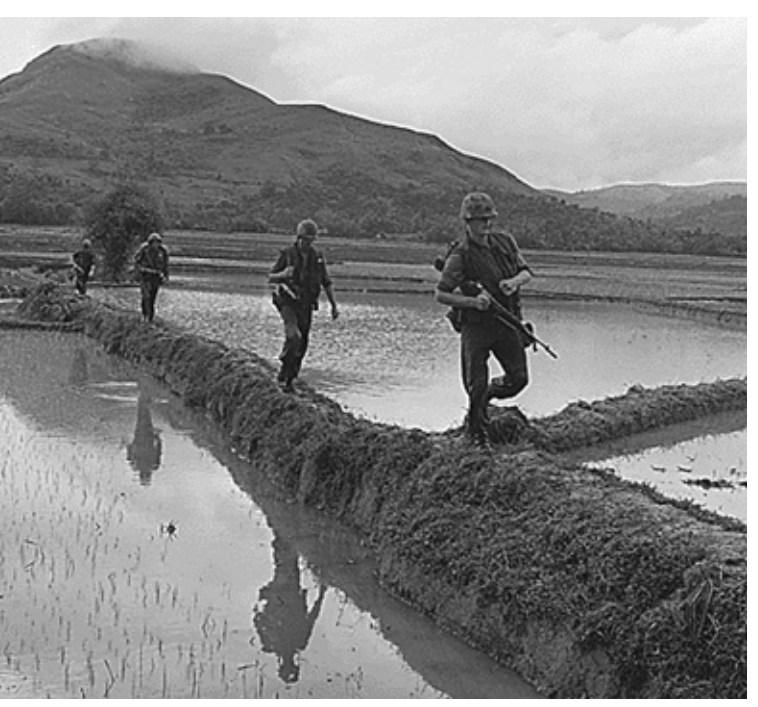
Marines of H Company, 2d Battalion, 7th Marines, move along rice paddy dikes in pursuit of the Viet Cong, 1965.