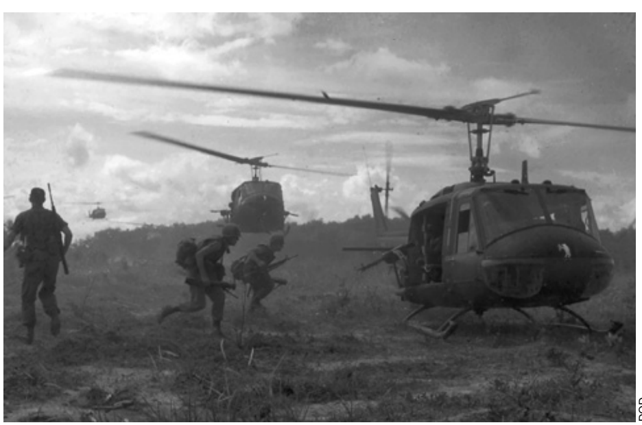
UH-1D helicopters airlift members of the 2nd Battalion, 14th Infantry Regiment from the Filhol Rubber Plantation area to a new staging area, during Operation "Wahiawa," a search and destroy mission conducted by the 25th Infantry Division, northeast of Cu Chi, 1966.

The best vehicle for this, based on the success of the CORDS program in Vietnam and the chas-