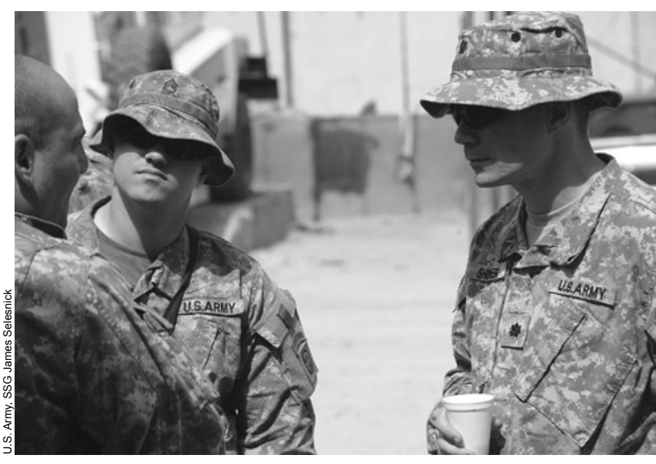
Soldiers from the Public Affairs Office listen to an NCO at Joint Security Station Zafaraniya, eastern Baghdad, Iraq, 18 April 2009.

Therefore, commanders and command sergeants major at all levels should challenge each other and challenge their Soldiers to help change our culture. This is not resource-intensive. We can and should make subjects such as honesty and integrity a common part of the conversation in motor pools, forward operating bases, training areas, orderly rooms, and athletic fields. We should talk