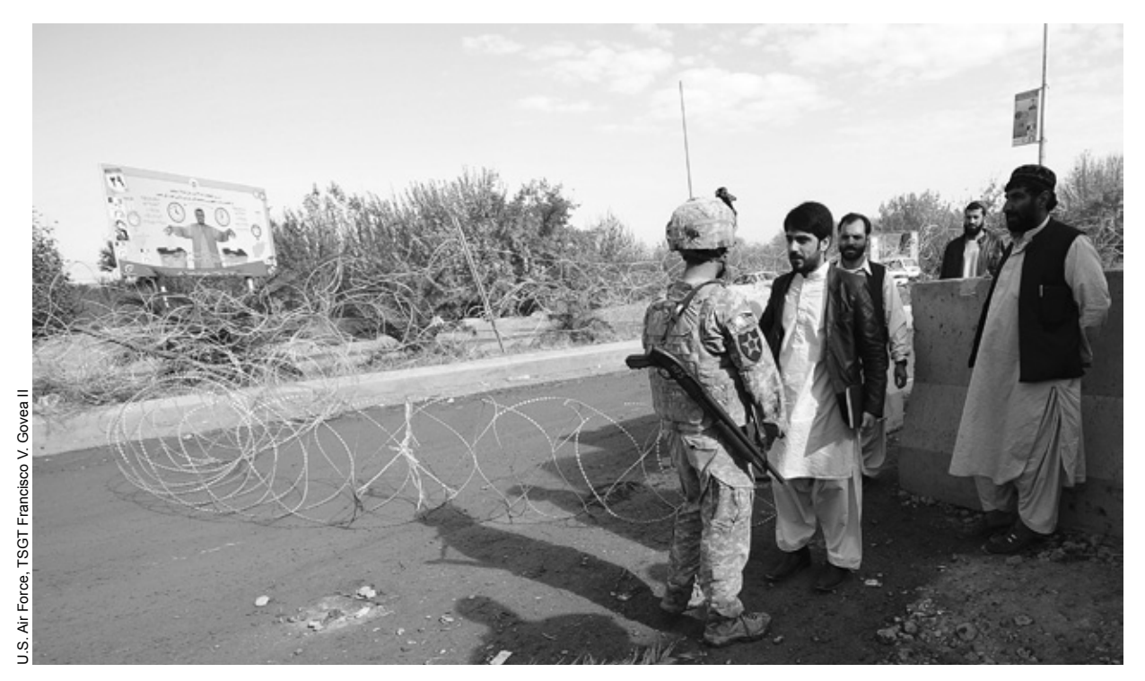
A Soldier searches people before allowing them to enter the joint district community center in Arghandab, Afghanistan, 1 December 2009.

The major differences in planning for stability and civilian support operations are—