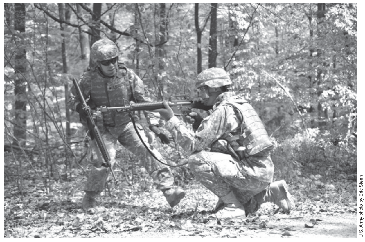
U.S. Army Soldiers from 52d Signal Battalion, Patch Barracks, Vaihingen, Germany, practice small-unit tactics during a Warrior Training Exercise, near Baden Wurttemburg, Germany, 5 May 2009.

decision making process, and time permitting, they can conduct a "post-mortem" analysis session scrutinizing courses of action, on the assumption that they will fail, and then attempt to discover how failure occurred. This technique opens the thinking process to more readily identify potential weaknesses in the plan.