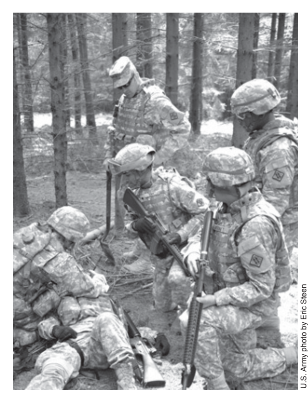
U.S. Soldiers from the 52d Signal Battalion practice small-unit tactics during a warrior training exercise at the Boeblingen Local Training Area in Germany, 5 May 2009.

Peer-to-peer integration and development. The emergent qualities of high-performing small units have a number of notable attributes—the synergistic capacity to work together; the ability to develop superior leaders (beyond the appointed leadership); the capacity to adapt; the flexibility to handle fast changing situations; and the resilience to maintain these characteristics in the face of adversity, including the death of team members. Recent work in the field of neurological sciences is making great