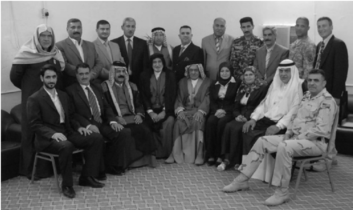
Unity Conference attendees, eastern Baghdad, 23 April 2010.

much of the country, including southeastern Baghdad and the Mada'in Qada. Other, more local, victories were important as well, such as establishing a tip line for informants and efforts to reduce vehicle borne improvised explosive devices. The initial message concluded with a final appeal to the group to work together to create faith, hope, trust, and unity.