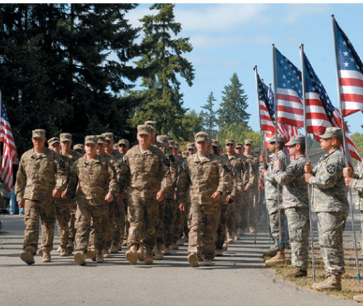
Soldiers of 4th Stryker Brigade Combat Team, 2nd Infantry Division, march into Soldiers Field House at Joint Base Lewis-McChord, Wash., 28 July 2013 during a welcome home ceremony. The 4th SBCT soldiers returned from a nine-month deployment to Afghanistan in support of Operation Enduring Freedom.

Recruiting and retaining future leaders will require unique adaptations to traditional Army leader-development models and practices. The Army must invest in its moral-development programs to overcome issues with moral fading and rationalization among its professional stewards and to prevent moral disengagement within the next generation of leaders. In nearly all cases of misconduct, both within and external to the Army, individuals understand the ethical implications of the situations in which they