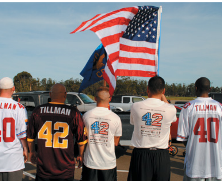
Members of the 30th Civil Engineer Squadron participate in a squadron-organized run to raise funds for the Pat Tillman Foundation in honor of fallen service member Cpl. Pat Tillman, Vandenberg Air Force Base, Calif., 17 April 2010

Determinations of public trust associated with integrity, competence, and predictability are arrived at through reason. People often base these on incomplete knowledge informed by the public's perception of the practices or principles on which the organization has agreed to abide. Integrity determinations reflect perceptions of an organization's adherence to implicit or explicit commitments, and normative assessments of its honesty and fairness in meeting those commitments. Lack of integrity can easily lead to perceptions of opportunism.