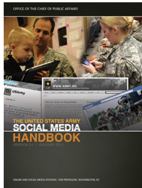
The United States Army Social Media Handbook.

The handbook also consolidates various and current Army policies in enclosures to ensure unit success and regulatory compliance.