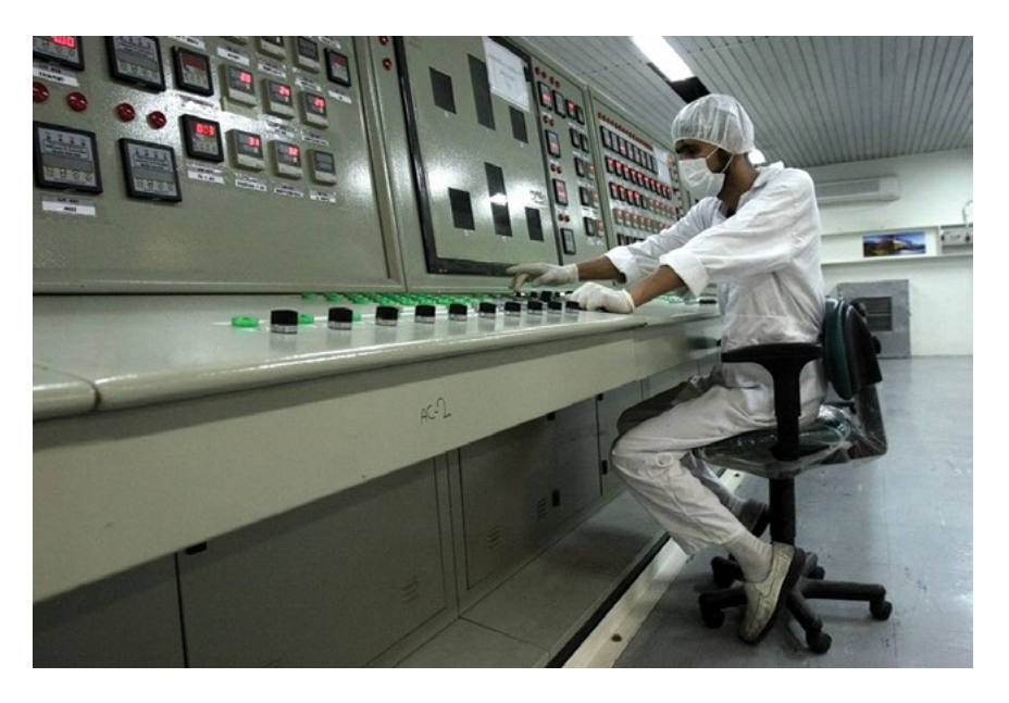
An Iranian technician works at the Uranium Conversion Facility just outside the city of Isfahan 255 miles south of Tehran, Iran, 3 February 2007.

The "I don't understand it" or "I can't get to it" misconception. Cyberspace capabilities, particularly OCO, tend to be shrouded in secrecy. OCO are highly classified because the nature of