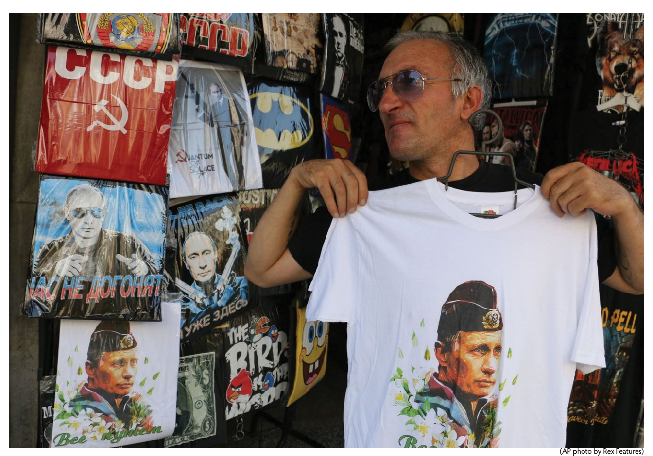
A man displays t-shirts featuring President Vladimir Putin at a market in Varna, Bulgaria, 16 September 2014. With the annexation of the Black Sea peninsula of Crimea, the t-shirts became very popular in the Balkan country where 300,000 Russian citizens live permanently.

At the time of this article's publication, none of these measures have had the effect apparently intended by the West on either Putin or the attitudes of the Russian people, mainly because Western Europe needs Russian natural gas. Quite the opposite, disapproval from the West, and the ineffectiveness of measures taken against Russia by the West, to protest