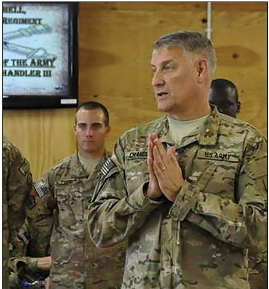
Sergeant Major of the Army Raymond F. Chandler III speaks with soldiers 22 September 2013 during a visit at Forward Operating Base Walton, Afghanistan. Chandler traveled to bases throughout southern Afghanistan to speak with soldiers about their concerns regarding current and upcoming Army events.

Using quantifiable survey data is hazardous without understanding the data and structure of the survey. For example, on a scale of one to ten, a leader who receives a five from reviewers but overrates himself or herself at a nine could have more issues than a leader who receives a four and self-assesses at four. The latter is much more self-aware than the former—and, is a score of four poor? What is being measured? Moreover, can multirater feedback across year groups or branches be compared for promotion potential? Typical multirater feedback for developmental purposes focuses on the leader and how the