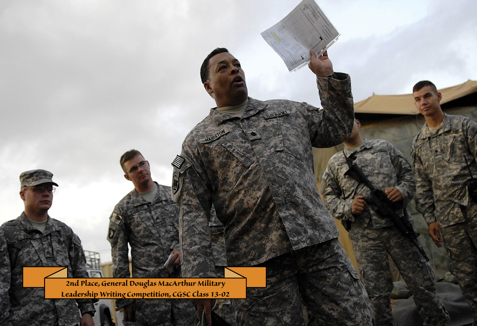
2nd Place, General Douglas MacArthur Military Leadership Writing Competition, CGSC Class 13-02