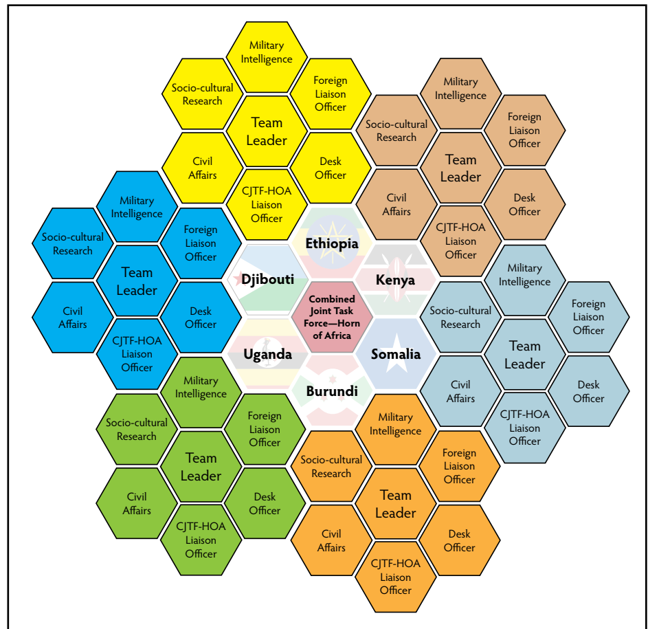
Figure 2. Hive Structure

To be sure, the shift to an unclassified environment has not been easy, and it has engendered some suspicion among U.S. service members. Nonetheless, by accepting the prudent risks of operating in an unclassified, collaborative environment, CJTF-HOA is opening lines of communication with countries in the region, increasing commitment to the sharing of best practices between countries, creating camaraderie, and