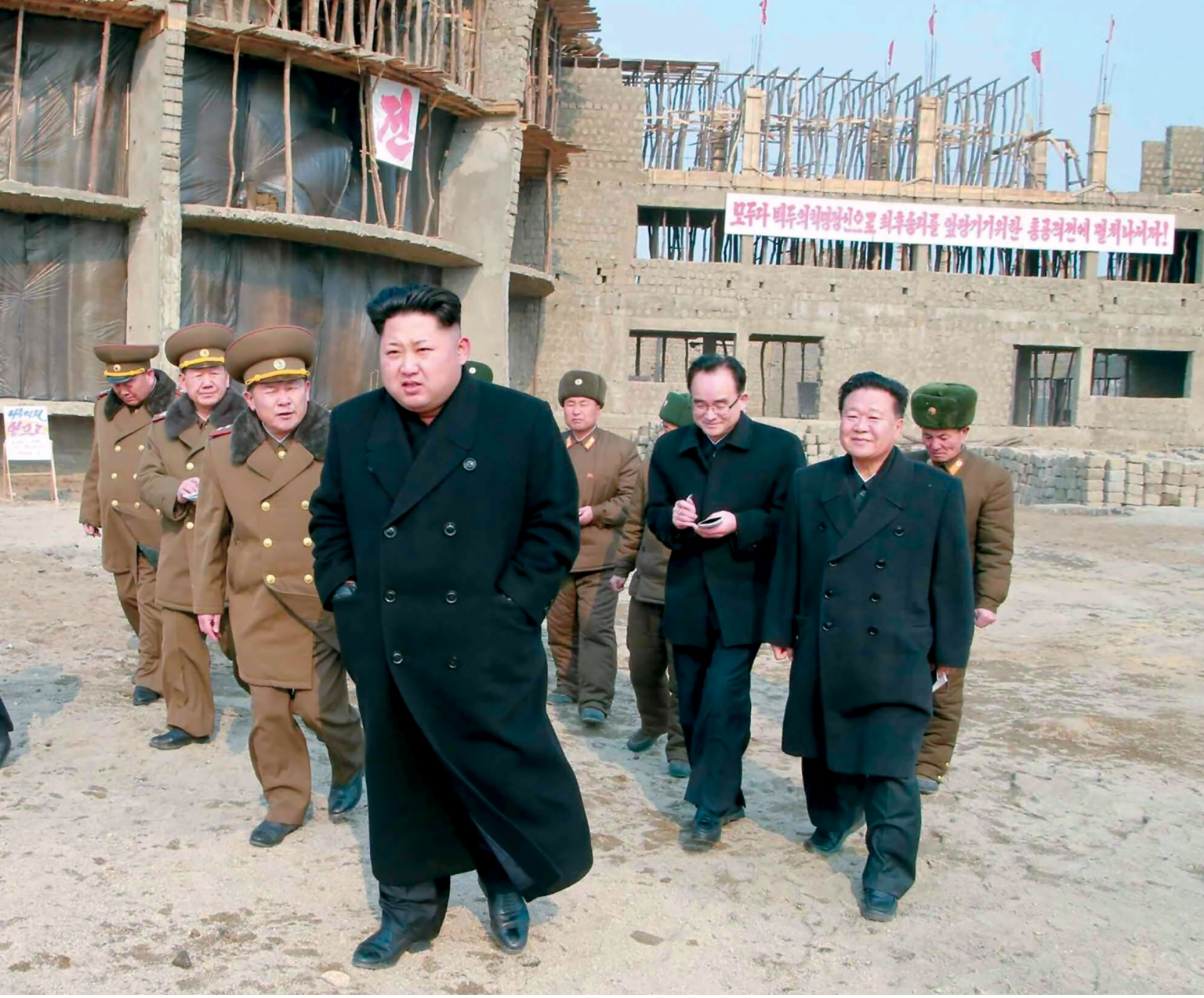
North Korean leader Kim Jong-un visits the construction site of an orphanage 11 February 2015 in Wonsan, Kangwon Province, North Korea. The quality of the construction shown in the photo is indicative of the problems faced in North Korea.

alter the strategic landscape of northeast Asia and significantly affect U.S. interests.