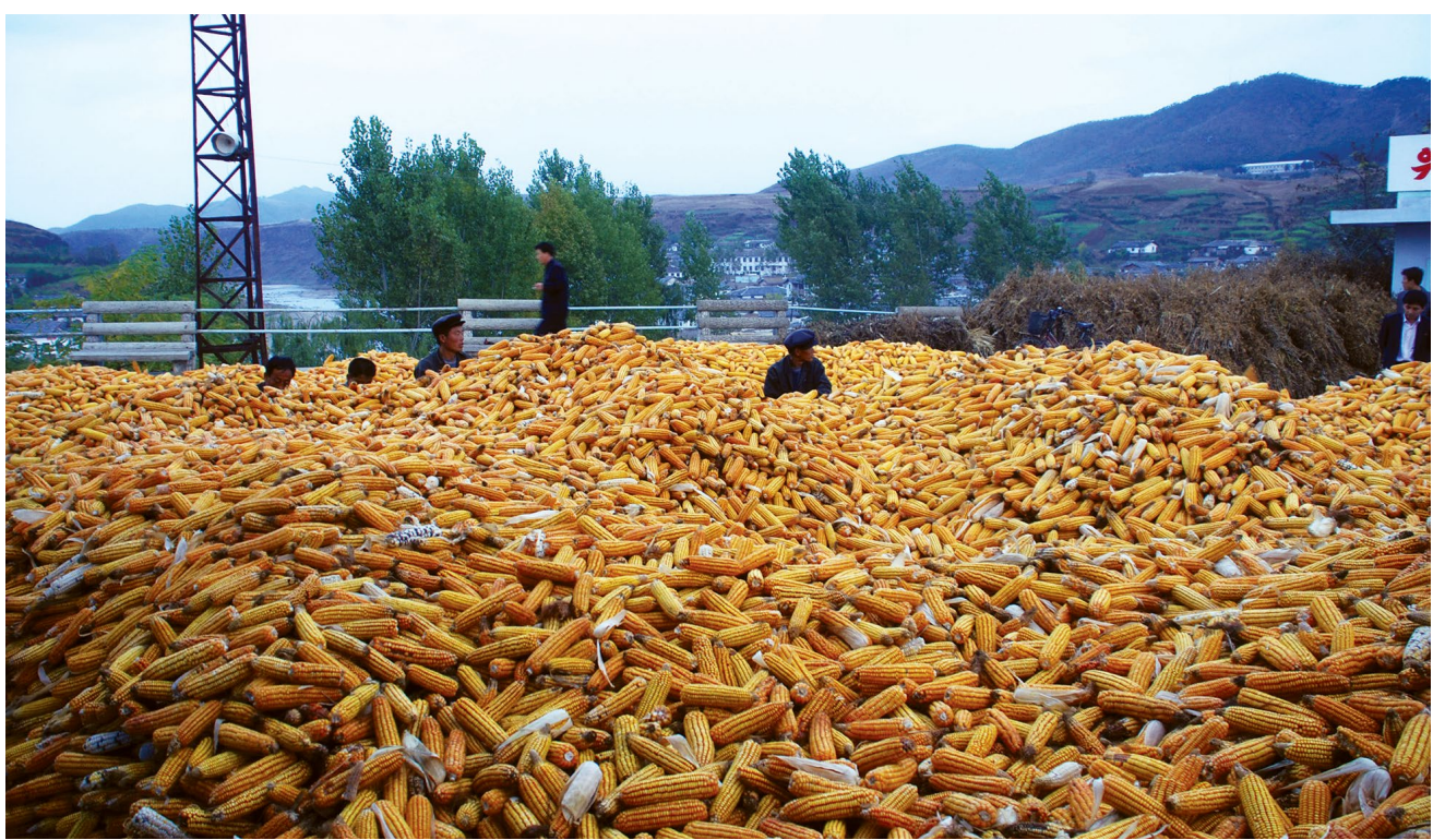
Farmers bring in the maize crop 24 October 2012 in North Hwanghae Province, North Korea. Because of a lack of proper storage facilities, the crop is lying out in the open, which could result in significant losses and contribute to North Korea's continual famine conditions.

Fortunately, we do not need to know the exact timing or nature of a North Korean collapse to understand and prepare for the challenges associated with it. We do not need to define every challenge in detail. We have enough knowable objectives, tasks, and problems to facilitate deliberate planning, as well as active preparation. Setting policy against and preparing for the knowns will leave us better postured to succeed when unknowns inevitably arise. Thus, we must ensure that prediction gives way to assessment, and that planning does not substitute for actual preparation for instability or reunification. We should move to set conditions for whatever may come, as well as to enhance deterrence and shape positive, stable change in North Korea.