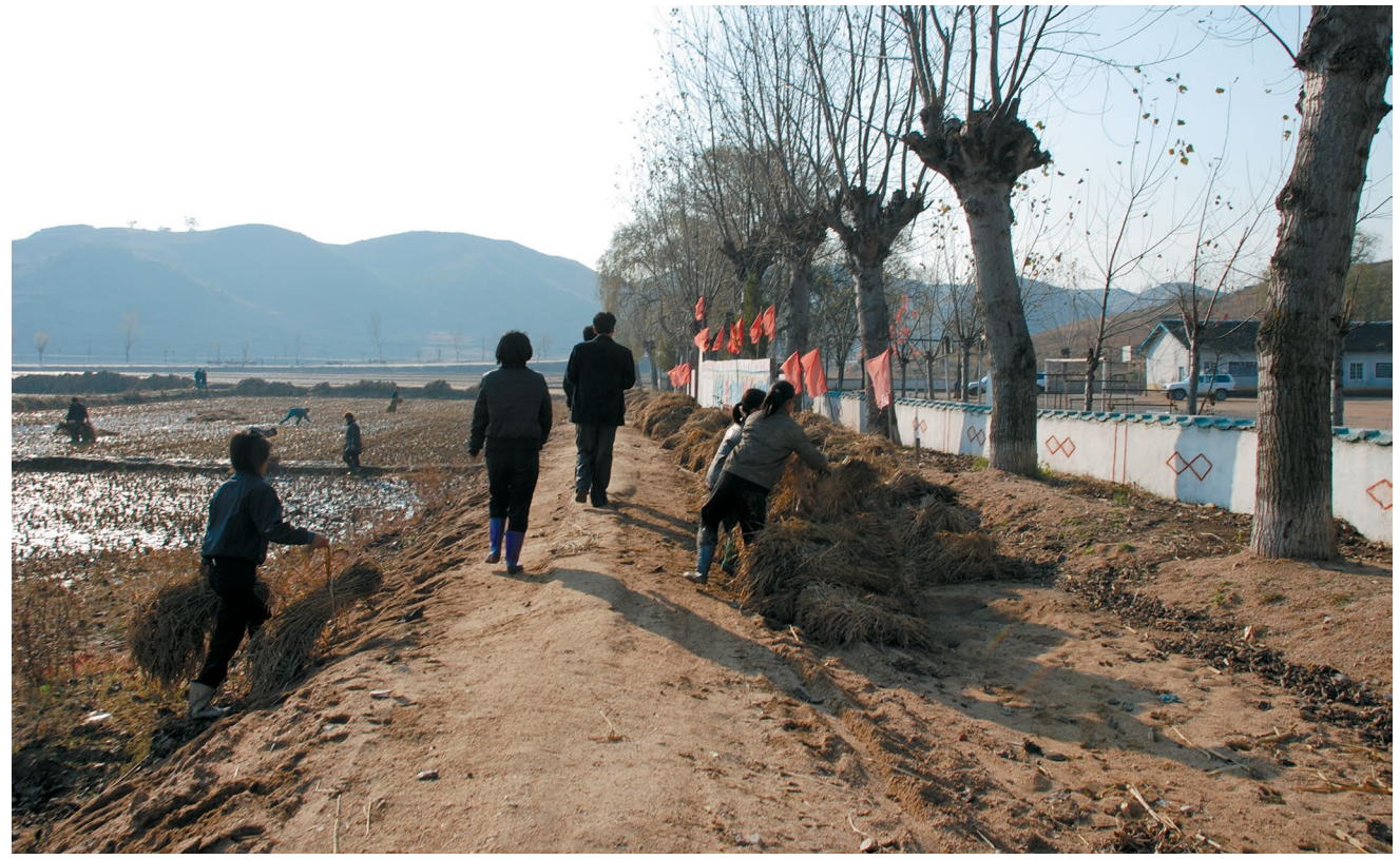
Young people from a collective farm in North Korea harvest crops 30 October 2012. Autumn rains had soaked the crops, which may have made them difficult to store. Citizens of North Korea continually face famine, exacerbated by the country's "military first" policy.

Korea, may not come about in a manner that offers a choice to the ROK other than direct involvement.<sup>13</sup>