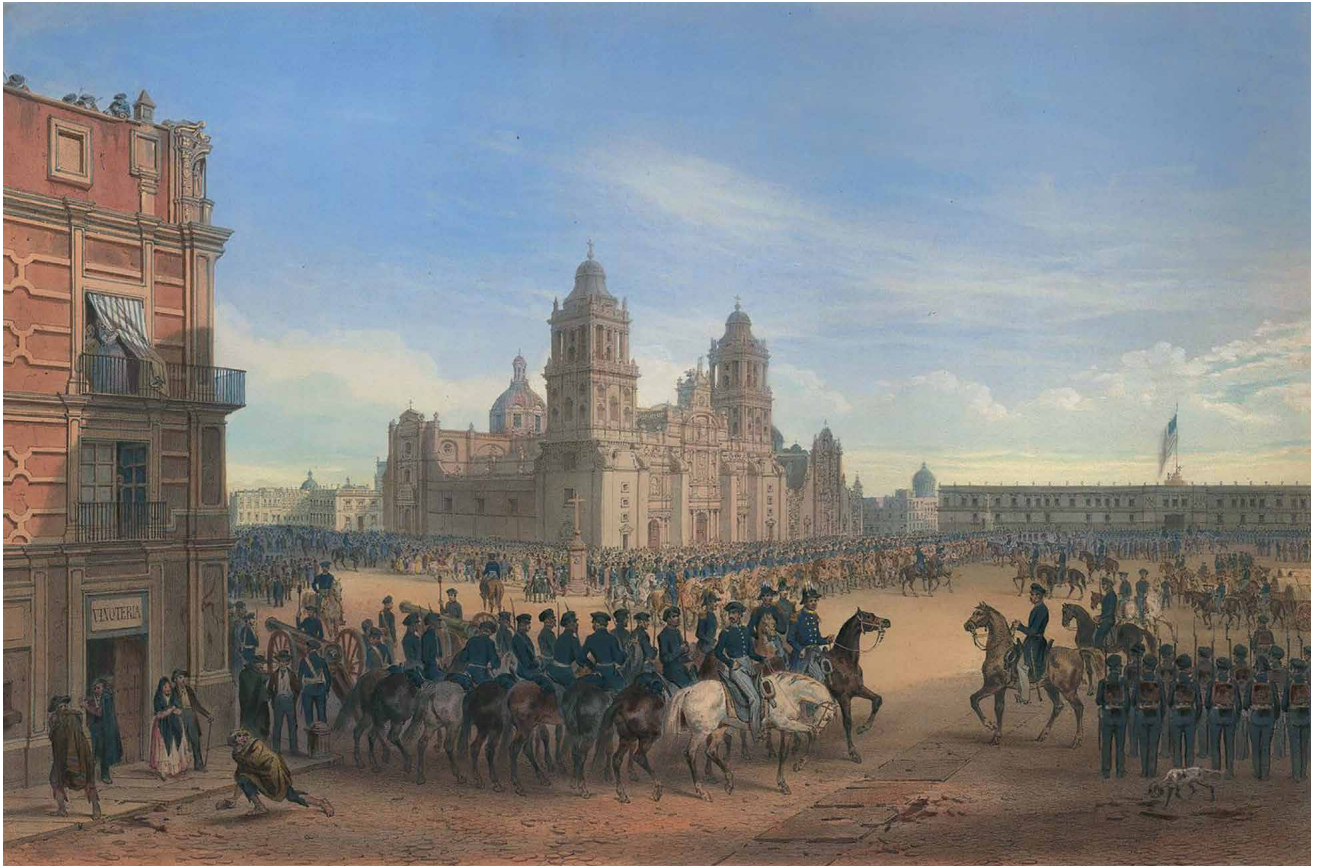
General Scott's Entrance into Mexico City (1850), hand-painted lithograph, by Carl Nebel.

regulars and volunteers contributed to the combined force. The commanding general employed a disciplined professional infantry to occupy the urban centers and to train allied Hispanic soldiers. He unleashed federalized Texas Rangers—irregular cavalry who had fought Mexicans and Indians for decades along embattled frontiers—to suppress the implacable guerrillas that preyed on convoys and outposts. Despite their tactical effectiveness, the Rangers' brutality toward Hispanic civilians threatened to undermine the expedition's broader pacification efforts. 21