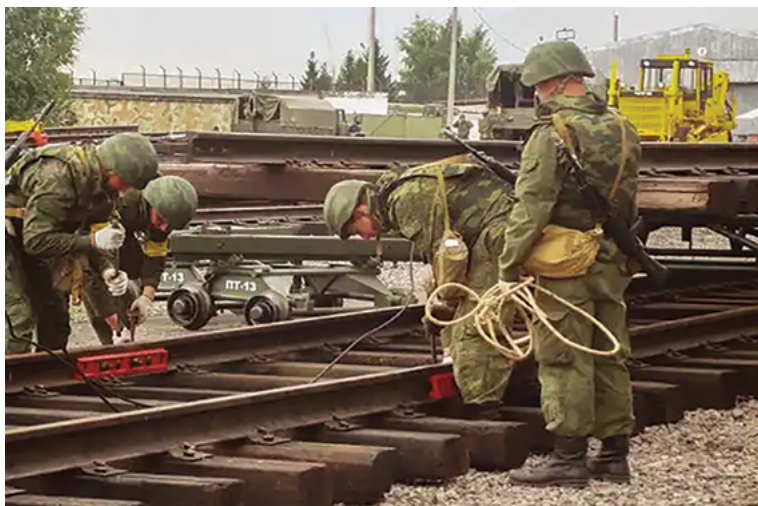
Soldiers participate in the “Best Specialist of the Railway Troops” contest 26 May 2015 in Russia's Western Military District. Railway troops are a special branch of the Russian armed forces that support logistical operations by executing all tasks related to the construction, maintenance, and defense of the Russian railway system. The Railway troops would play a key role in any military operation against the Baltic states by working to ensure the continuity and security of railway logistical support to forward-deployed forces.

Yet such a fluid concept of tactics and operations is difficult to reconcile with fixed ground lines of communication based on railways. The overly complex logistical system Russia inherited from the Soviet Union was overhauled and ten material-technical support ( Materialno-tekhnicheskogo obespechenie or MTO) brigades were created. 8 Each MTO brigade is committed to supporting one combined arms army (CAA), with two in the Western Military District (MD), two in the Southern MD, two in the Central MD, and four in the Eastern MD. 9 It appears that an eleventh MTO brigade was formed somewhat recently, possibly to serve the 1st Guards Tank Army in the Western MD. Each MTO brigade fields two truck battalions, each battalion comprising 408 transport vehicles (148 general freight, 260 specialized, with 48 trailers). Each battalion “can reportedly haul 1,870 tons of cargo (1190 tons of dry