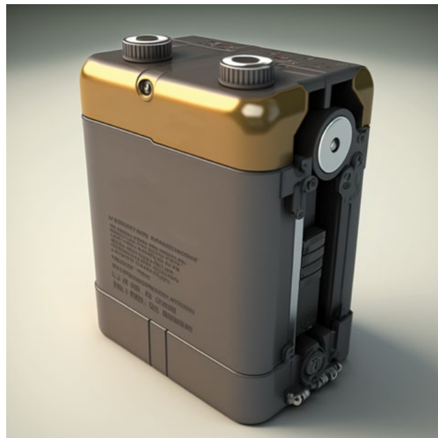
Concept of a nanoenergetic battery (AI image generated by Charlotte Richter, Military Review )

of Elements appear to be the next advances in the design of nonthermite energetic materials with even greater reaction rates and energetic yields. As with any new material and especially those formulated at the nanoscale, the impact on both the environment and human health will need to be assessed using