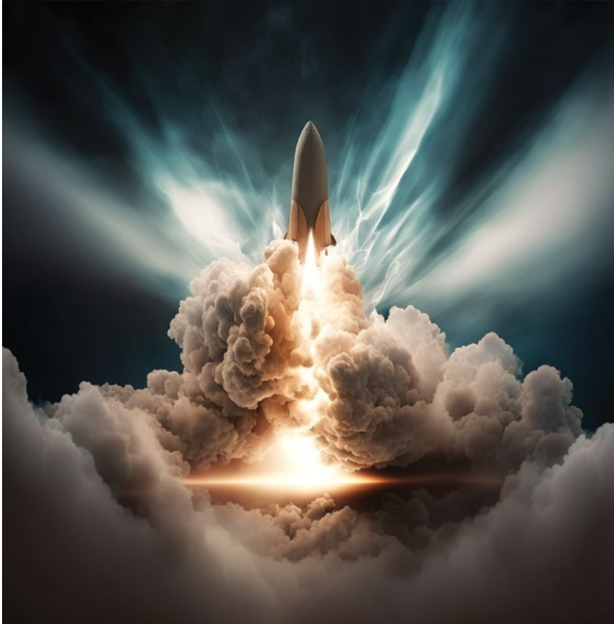
Exhaust plume of a nano-composite fuel hybrid rocket (AI image generated by Charlotte Rich-ter, Military Review )

As with all applications of nanoenergetic materials, the rate of ignition and combustion is affected by the oxide layer in the nanometer range that forms on