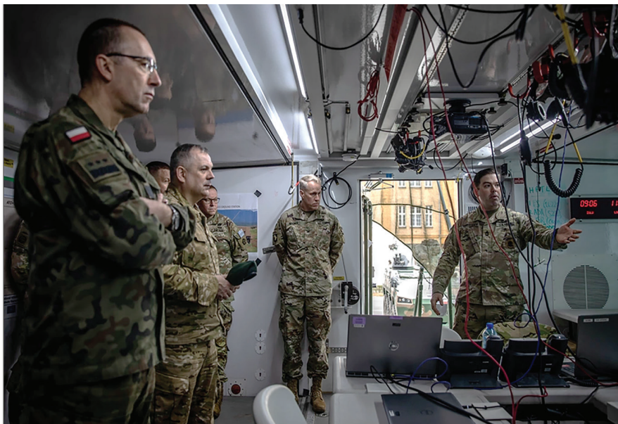
The 4th Infantry Division G-2 Strike Cell operates “live” in Poland during a NATO multinational exercise in 15–19 April 2023.

prosecution. Through a series of training and real-world experiences, the 4th Infantry Division (4ID) demonstrated that division G-2s can, in fact, mitigate these challenges by successfully incorporating and relentlessly exploiting NTM-derived information during its targeting process. This article argues that diversifying the types and levels of collection (i.e., tactical, theater, and national) results in a more robust and effective division collection capability—one that better facilitates situational understanding and targeting in support of the commander’s objectives in a contested environment.