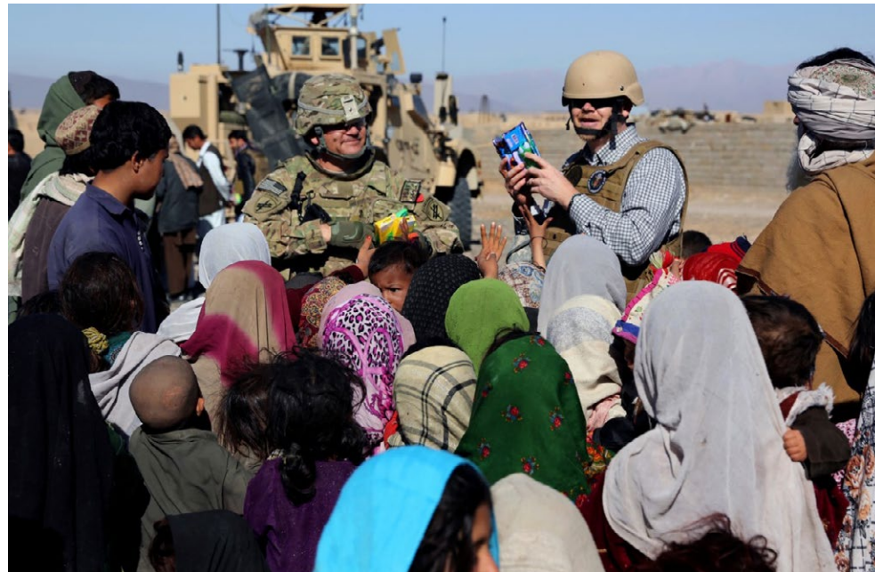
Feb. 9, 2013 — Soldiers and civilians in Farah, Afghanistan pass out toys and school supplies while visiting refugees.