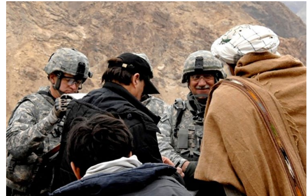
Dec. 14, 2009 — Leaders from Task Force UTE, 405th CA BN, along with a Human Terrain Team member, meet with a village elder to discuss clean water and ways to improve the village's sanitation in Parwan Province, Afghanistan.

However, regardless of where the responsibility is placed, now is the time to act. With the end of combat operations in Afghanistan, DOD stands to lose a significant amount of institutional knowledge in the near future. A 2012 Government Accountability