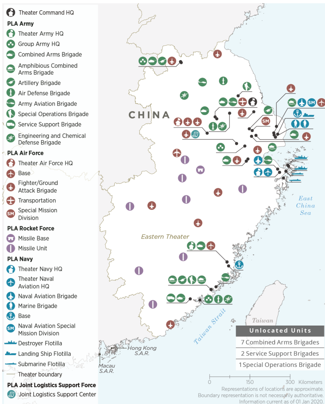
(Figure from the Office of the Secretary of Defense, Annual Report to Congress: Military and Security Developments Involving the People's Republic of China 2020 , https://media.defense.gov/2020/Sep/01/2002488689/-1/-1/1/2020-DOD-CHINA-MILITARY-POWER-REPORT-FINAL.PDF )

The DOD includes PLA forces in China's eastern and southern theaters as available for Taiwan