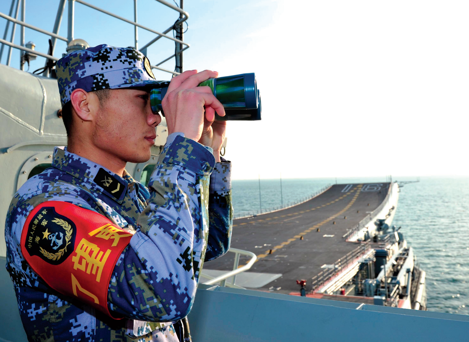
A naval soldier of the Chinese People's Liberation Army Navy looks through a pair of binoculars from onboard China's first aircraft carrier, Liaoning , as it visits a military harbor circa 2013 on the South China Sea in Sanya, Hainan Province, China.

that of the United States. Overcoming the integration of forces, breaking cultural barriers, and including highly critical after action reviews are telling signs of military maturity. Strategic opportunity has given the PLA the ability to reinvent its fighting capability while not being in a hyperwar. With a trained and capable joint force, the PLA is prepared for employment.