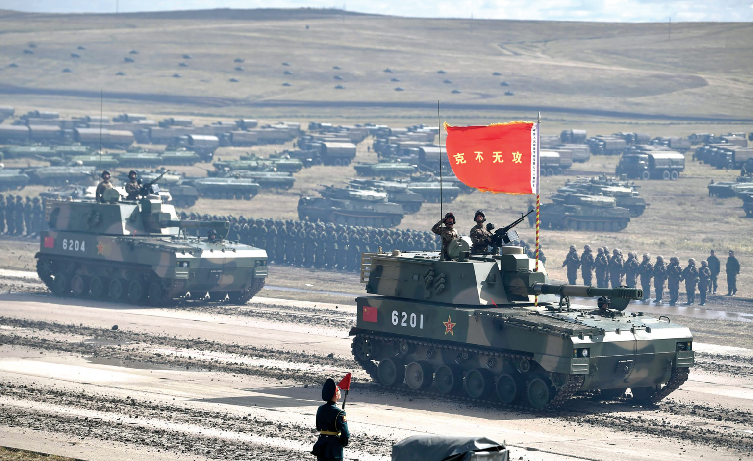
Chinese armored vehicles pass in review September 2018 at the end of the Vostok 2018 military exercise at the Tsugol training ground in Eastern Siberia, Russia. The exercise involved Russian, Chinese, and Mongolian forces. Chinese participation included three thousand troops, nine hundred tanks and military vehicles, and thirty aircraft.