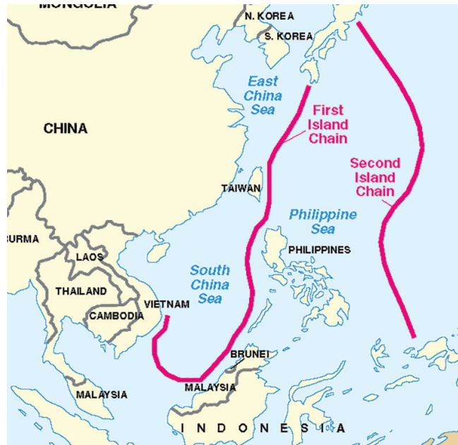
(Figure from Office of the Secretary of Defense, Annual Report to Congress: Military Power of the People's Republic of China, 2006 [Washington, DC: Department of Defense, 2006]; boundary representations are not necessarily authoritative)

This world order uses military intimidation in economic coercion, transactional political payoffs, and lethal and nonlethal levers to support its current campaign. To create further challenges for U.S. forces, the Chinese use economic espionage, intellectual theft, cyber operations, and academic espionage to mitigate