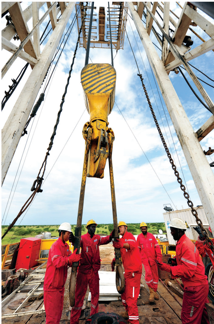
Chinese workers from the Zhongyuan Petroleum Exploration Bureau of Sinopec and Sudanese workers drill an oil well 26 October 2010 in South Sudan, Africa. China has invested billions of dollars in the oil sector and has a large number of Chinese workers in the oil fields in Sudan. The Export-Import Bank of China is receiving one-sixth of South Sudan's oil production to fund a large infrastructure project around the central region of Sudan. China is working with number other African nations to explore for, and develop, oil fields.

However, despite the clear warning signs, the CCP continued to plan for increased domestic production. While the Central Intelligence Agency estimated that Chinese oil reserves were diminishing, the CCP optimistically continued to plan for an average 8 percent annual increase in domestic production during its sixth five-year plan (1981–1985) and an average 4 percent annual production increase during its seventh five-year plan (1986–1990). 21 A 1994 Oil and Gas Journal article noted that Chinese exports peaked at 612,800 barrels per day in 1985 and required no imports to support domestic consumption between 1985 and 1987. 22 But, by 1988, exports plunged, and imports picked up by 100 percent per year. 23 Approximately 15 billion yuan renminbi were invested in the discovery of new wells, as well as an unknown number of billions in foreign investment. 24 However, because of the aforementioned rising cost in production and declining reserves, by 1987, most Chinese production had plateaued or was declining due to production costs. Because of this, in 1987, China National Import &