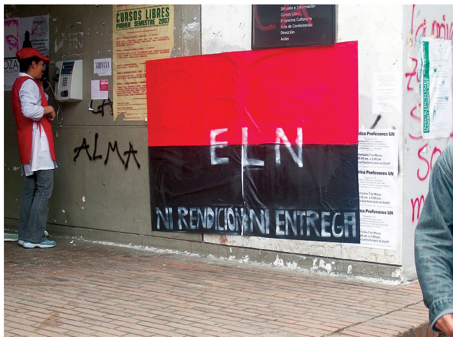
A National Liberation Army ( Ejército de Liberación Nacional) guerrilla poster 7 March 2007 at the León de Greiff Auditory, National University of Colombia in Bogotá. The poster reads "Ni Rendición, Ni Entrega," which translates to "Neither Surrender, Nor Yield."