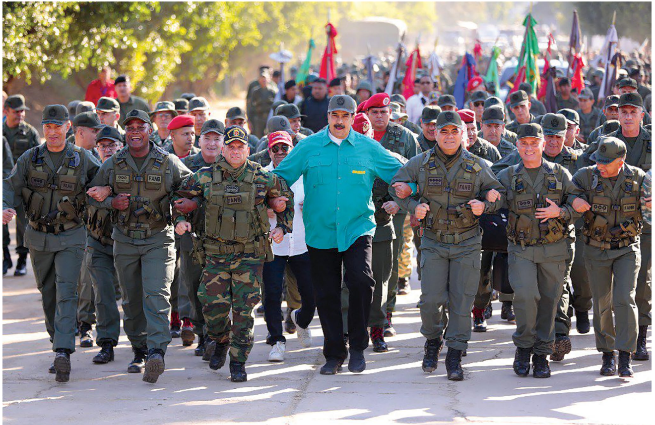
Venezuela's disputed President Nicolás Maduro marches with members of the Venezuela's armed forces 27 January 2019 during military exercises at Fort Paramacay in Naguanagua, Carabobo State, Venezuela.

the recent FARC reorganization and possible internal schism may have redounded to the benefit of the ELN as it moved to fill an insurgent void left by the demobilizing FARC forces. As a result, there are some indications that we may be witnessing the ascendance in status of the ELN within the Bolivarian movement, especially as an enforcement arm of its PSUV and PCC hosts within and near Venezuelan country borders.