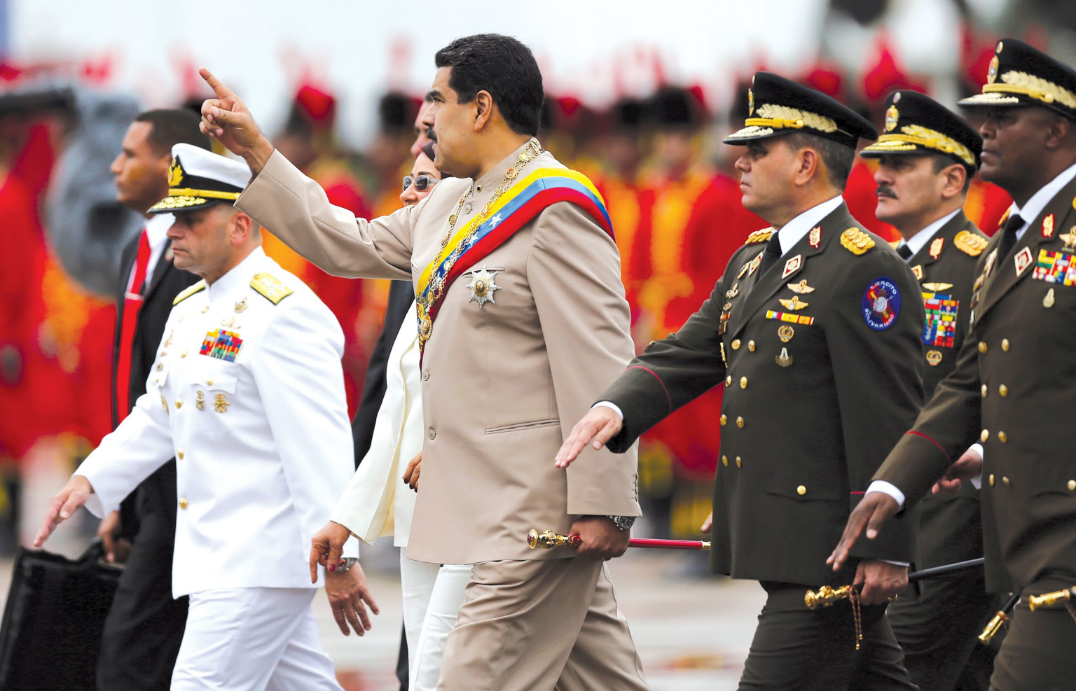
Venezuela's disputed President Nicolás Maduro carries the army commander's baton 24 June 2017 as he arrives for Army Day celebrations at Forte Tiuna in Caracas, Venezuela. Maduro joined the army celebration while thousands marched in the streets of the capital to demand restraint from government security forces after more than seventy people had been killed during almost ninety days of protests seeking his removal.

enterprise, if not its ideology, guided by a large Cuban presence funded in turn by the Russians, Chinese, Turks, Iranians, and others. This year, the U.S. government announced arrest warrants and accompanying bounties for the apprehension and delivery of Maduro, Diosdado Cabello and other senior regime leaders. 2 Even if successful, how such arrests might change the presence and grip of Cuban Communist Party (PCC) elements over the reins of control in Venezuela is unclear.