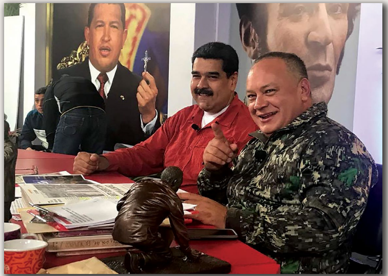
Venezuela's disputed President Nicolás Maduro (left) joins the president of the Venezuelan National Constituent Assembly, Diosdado Cabello, to celebrate the two hundredth chapter of the "Con el Mazo Dando" program 12 April 2018 on set in Caracas, Venezuela. Cabello is host of the program that is broadcast on the Venezuelan state channel, Venezolana de Televisión.

First tier. The Cuban Communist Party ( Partido Comunista de Cuba , or PCC) with its subordinate United Socialist Party of Venezuela ( Partido