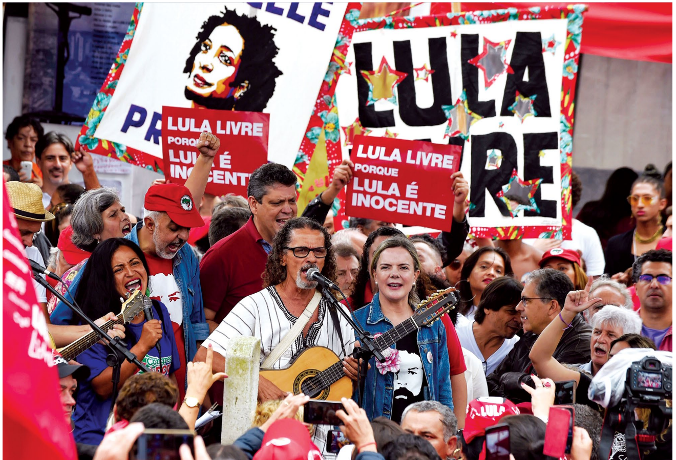
Workers' Party President Gleisi Hoffmann ( center right) attends a demonstration 7 April 2019—the anniversary of the incarceration of former Brazilian President Luiz Inácio Lula da Silva—outside the jail where Lula was being held in Curitiba, Brazil. While Lula was serving a twelve-year sentence for corruption and money laundering, he and his party maintained his innocence and claimed persecution by political enemies to prevent him from running again for president. He was released from prison in November 2019 based on a procedural ruling after being incarcerated for eighteen months.

Socialista Unido de Venezuela , or PSUV) are at the apex of the regional anti-American network collective. 4 Also, although not currently in control of the reins of its country's central government, the Brazilian Workers' Party ( Partido dos Trabalhadores , or PT) is a third leading organization within the whole network. 5