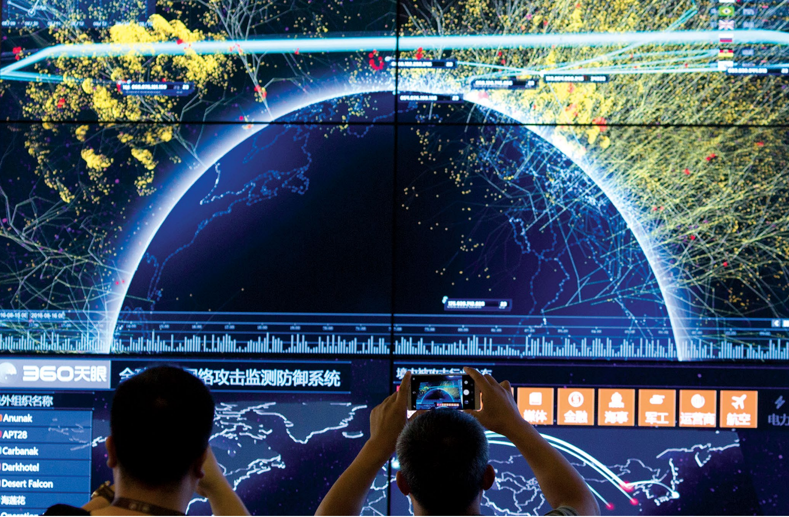
A conference attendee photographs an image depicting global internet attacks on 16 August 2016 during the 4th China Internet Security Conference (ISC) in Beijing. Having reached a level of sophistication today that renders even the most advanced internet protection systems vulnerable to sustained hacking attacks, Chinese government-sponsored internet theft of proprietary information of all kinds (e.g., industrial, scientific, military, economic, and personal) from the United States and other nations has reached pandemic proportions.