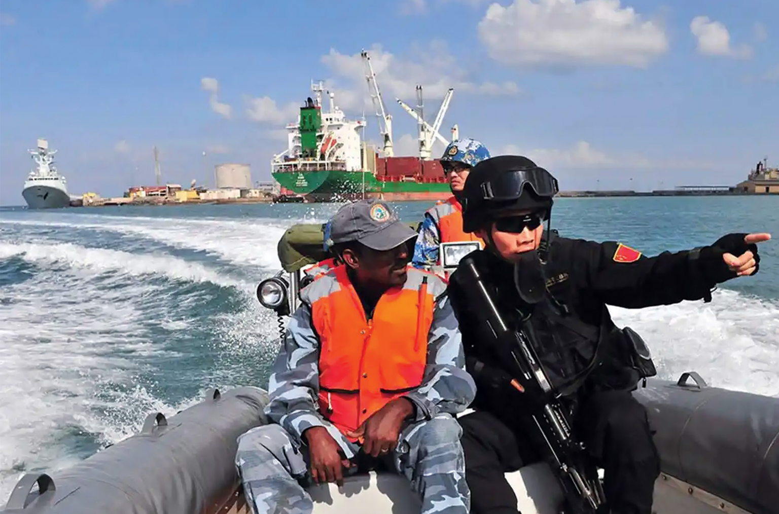
The Chinese navy conducts its first joint maritime exercise with Djibouti in 2015. China said its then new outpost would be largely to support Chinese forces on missions such as antipiracy patrols off of the Somalian coast.