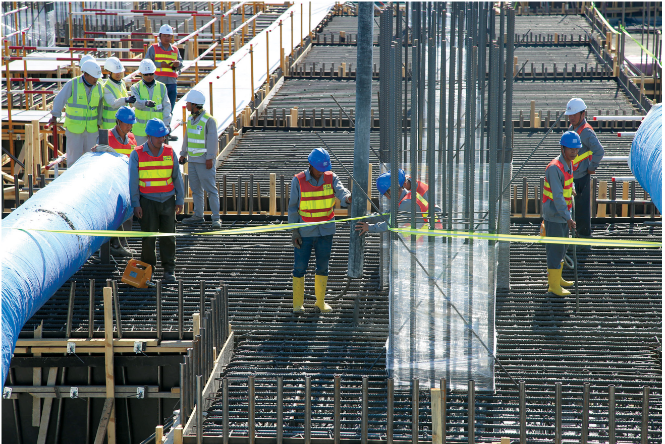
Employees work at the construction site of the Hunutlu Thermal Power Plant, China's biggest project with direct investment in Turkey, 22 September 2019 in Adana, Turkey. The $1.7 billion (USD) project spearheaded by the Shanghai Electric Power Company is a flagship project linking the China-proposed Belt and Road Initiative with Turkey's Middle Corridor.

Enduring competition is defined here as the judicious use of a nation's power to defend democracy and influence allies and partners to counter adversaries. Enduring competition is critical to any future strategy because its low cost, compared to the costs of military deterrence or economic investment, allows the United States to compete in the periphery. The periphery are nonpriority regions that remain important to strategic competition—given partnerships, their geostrategic positions, or access to natural resources. The United States risks ignoring adversary investments in these areas at its own peril.