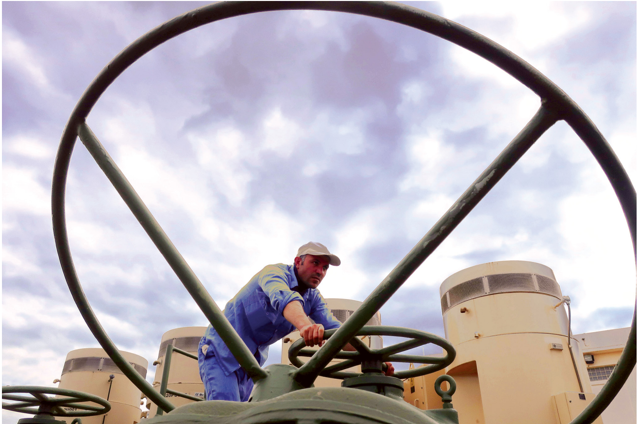
An Ifras Water Center technician adjusts the water intake settings 26 March 2018 according to the new operations and maintenance protocol introduced by the United States Agency for International Development (USAID) Iraq Governance and Performance Accountability (IGPA)/Takamul Project in Erbil, Iraq. With the help of USAID, IGPA supports the water directorates across Iraq provinces and in the Kurdistan region to better respond to citizens' urgent calls for stable potable water services by reengineering the water system's workflow and operations. Projects like this help the United States compete with China by offering more attractive options for foreign partnerships.

The goal of enduring competition is to defend democracy and disrupt adversary tempo through foreign partners. This mechanism is a complementary but not competing effort to traditional deterrence and diplomacy. It is not a silver bullet, but it promises preventive