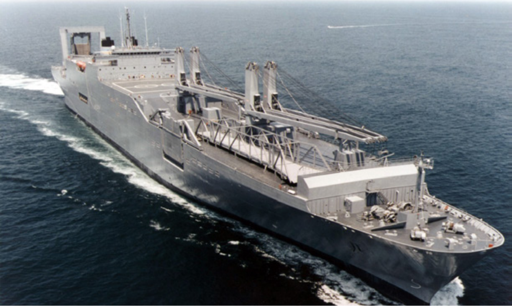
USNS Gordon