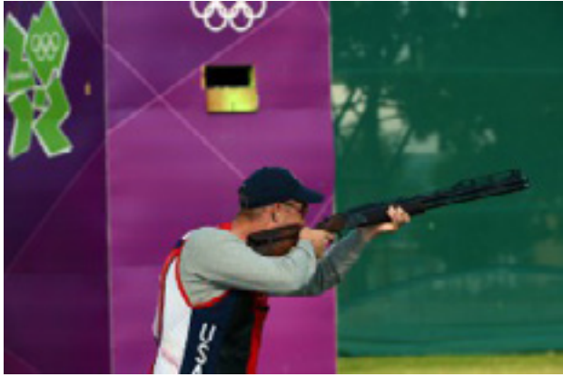
U.S. Army Marksmanship Unit shotgun shooter Sgt. 1st Class Glenn Eller shoots during the opening round of Olympic men's double trap qualification at the Royal Artillery Barracks range at the 2012 London Games. Eller, the 2008 Olympic gold medalist, is scheduled to compete in his fifth Olympics at the 2016 Rio Games.

from New Mexico, just doing my thing. I'm going to give it my best like I've always done."