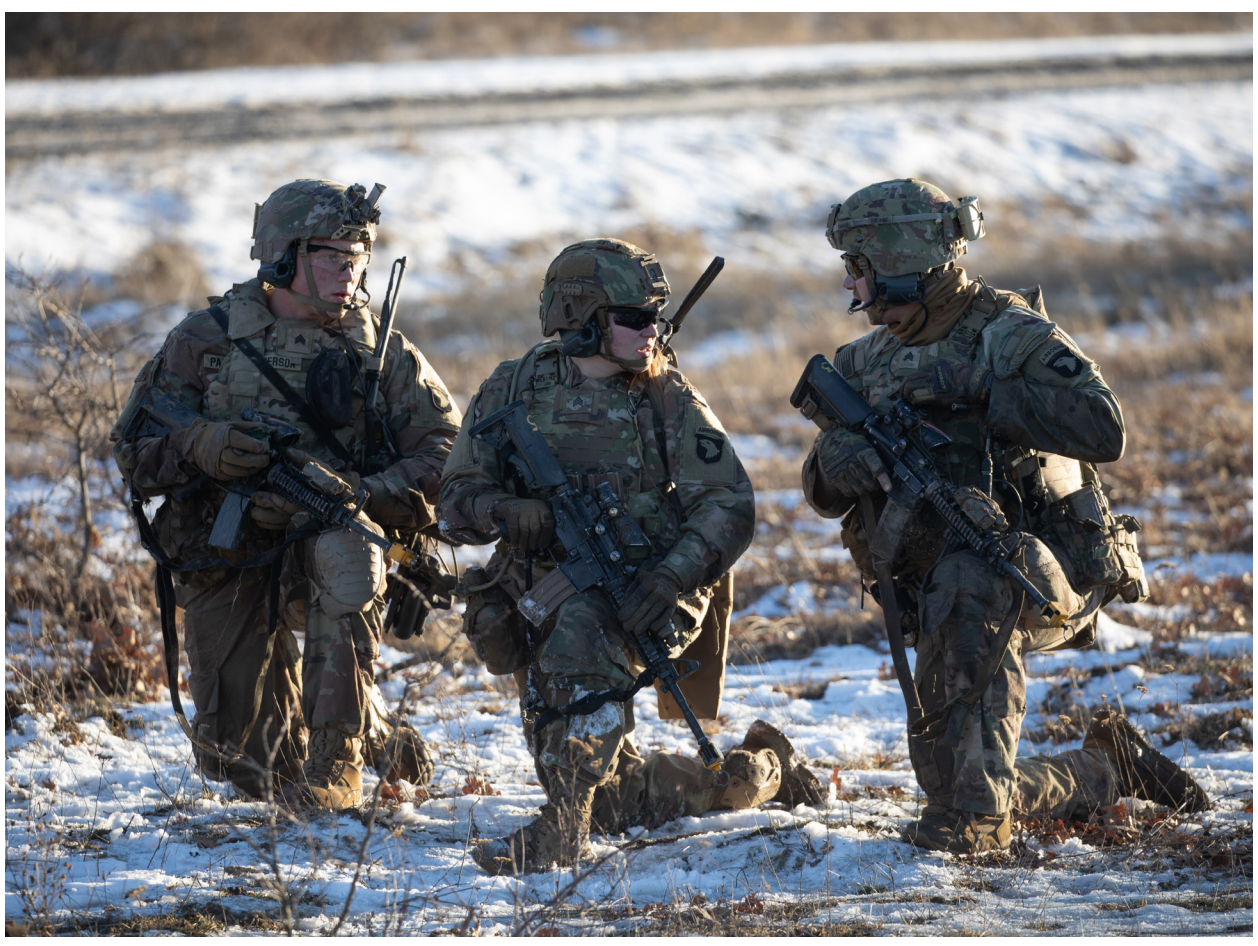
Soldiers discuss their next squad tactics movement at Cincu Training Area, Romania, Jan. 30, 2024. Professional dialogue provides a deeper understanding of colleagues' perspectives and communication methods. These conversations also help them examine their biases and become more self-aware.

Essay writing helps critical thinking by allowing writers to synthesize, hypothesize, and evaluate ideas.