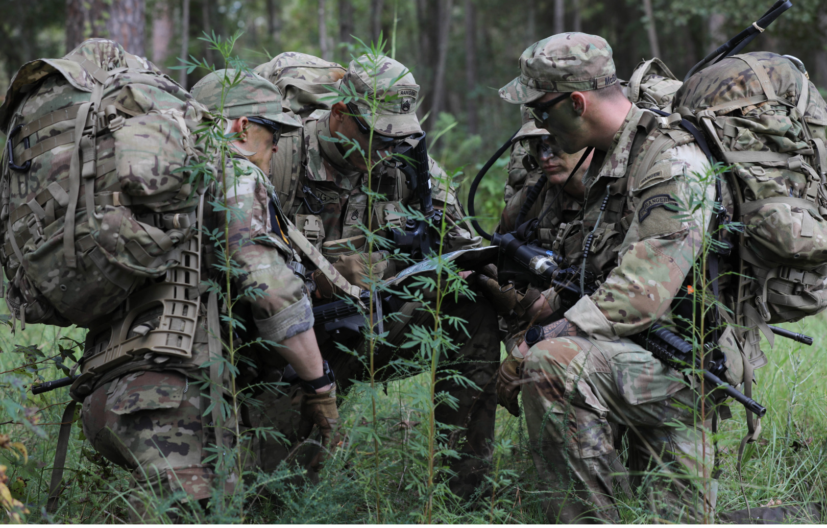
Soldiers study a map during a situational training exercise at Fort Stewart, Georgia, Oct. 1, 2023. NCOs must collaborate, analyze information, and use critical thinking skills in the field to make informed decisions in dynamic and uncertain environments.